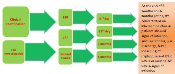
Figure 1: Flow chart for collection of data

postoperative period. The wound was inspected for any evidence of infection starting from the 3rd day and then 12th post operative day. Patients were followed up till discharge. For the patient who satisfied any of the criteria for wound infection, wound swab was sent to the clinical microbiology laboratory for routine culture methods. The incidence rate was calculated for each wound separately. Collected data was analyzed by 't'-test and Chi-Square test. About 100 adult patients who were taken up for elective procedures, at Father Muller Medical College Hospital were evaluated and assessed preoperatively, intraoperatively and postoperatively for a period ranging 6-24months.